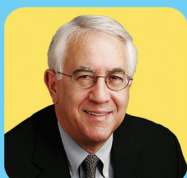
Hon. Bruce Meyerson