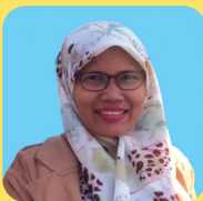
Raihal Fajru Aceh Besar, Indonesia