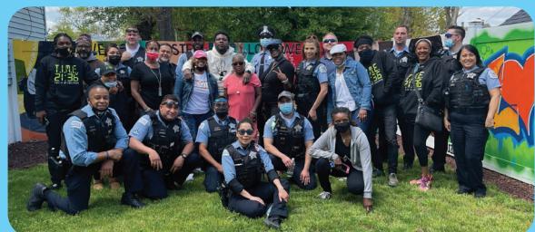
Metropolitan Peace Initiatives and Chicago Police Department

Through this focused approach on collaboration with hyper-local community-based organizations and the empowerment of outreach workers and peacekeepers, Metropolitan Family Services is making substantial progress towards a safer, more unified Chicago.